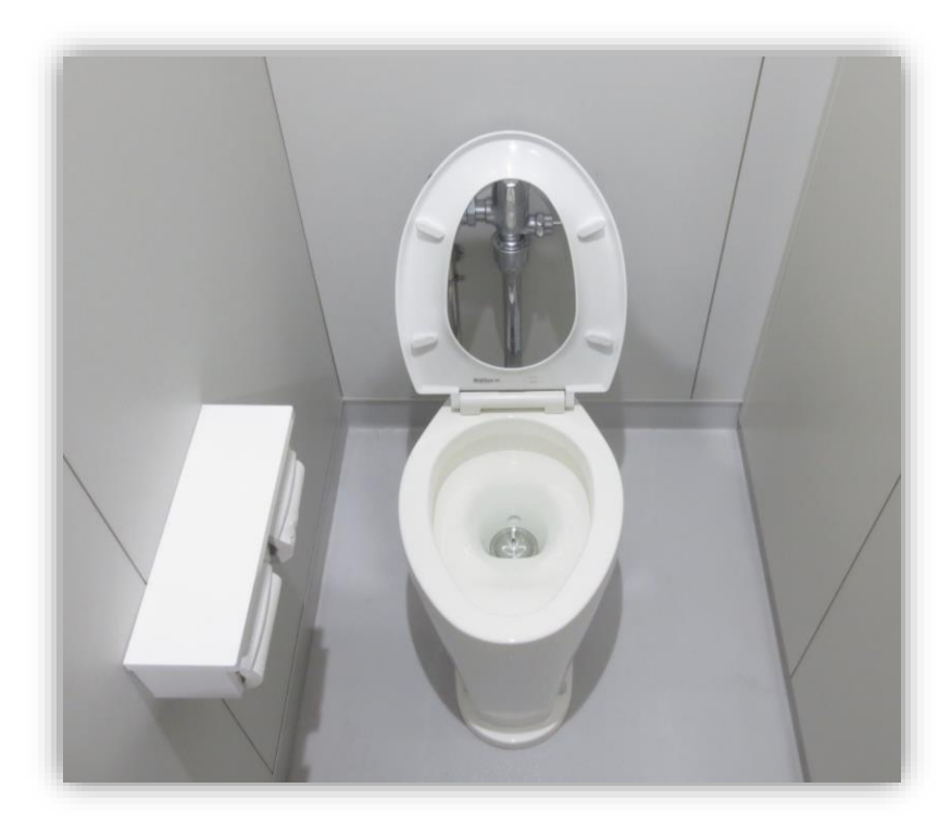
Usually, used as a flush toilet

" \alpha " can be used comfortably and hygienically even indoors as compatible with odors.